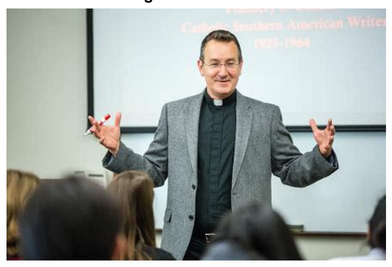
Tuesday, March 28 7:00PM-8:30PM