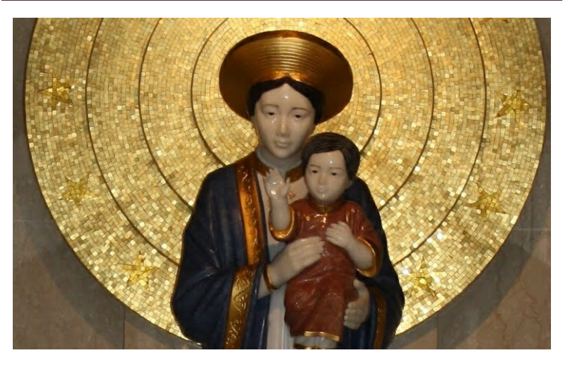
Thursday, March 2 3:00PM-5:30PM